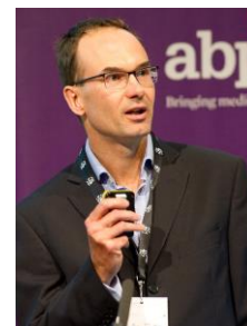
Director of the MRC Biostatistics Unit and Professor of Biostatistics at the University of Cambridge.

Each of the themes is anchored in important scientific questions arising from our key partners, questions which both motivate methodological developments and ensure their impact. We are contributing to progress in tackling many common and rare diseases with active projects in dementia, and Alzheimer's disease, cardiovascular and metabolic diseases, , auto immune diseases, oncology, blood-borne viruses, respiratory infections and antibiotic resistance.