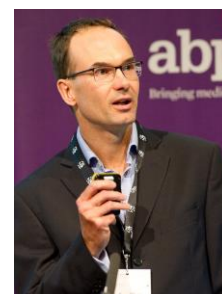
Director of the MRC Biostatistics Unit and Professor of Biostatistics at the University of Cambridge.

Each of the themes is anchored in important scientific questions arising from our key partners, questions which both motivate methodological developments and ensure their impact. We are contributing to progress in tackling many common and rare diseases with active projects in dementia, and Alzheimer's disease, cardiovascular and metabolic diseases, , auto immune diseases, oncology, blood-borne viruses, respiratory infections and antibiotic resistance.